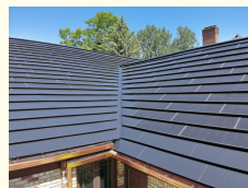
Solar tiles (2)