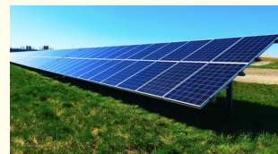
Ground Mounted Solar (2)