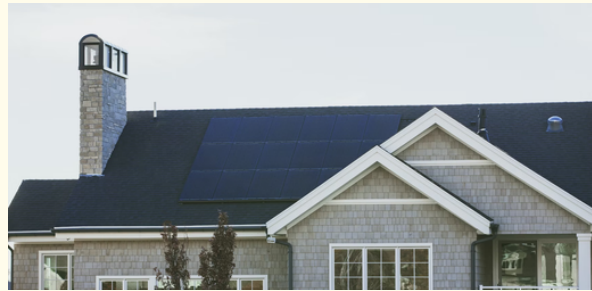
Rooftop solar (2)

“Rooftop solar uses solar photovoltaic (PV) panels to turn sunlight into electricity. PV panels can be installed on your roof or even in your yard. When sunlight shines onto a PV panel – even on a cloudy day – your solar system will generate clean, renewable energy. Rooftop solar provides zero-carbon, no-cost electricity once it’s installed and paid for. Depending on your situation, it might make sense to buy your rooftop solar outright or finance your purchase over a number of years” (1). “It will be easiest to go solar if you live in a single-family house that