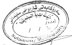
Mayor of Sulaymaniyah, KRG-Iraq